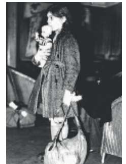
Above: Refugee girl, part of a Children's Transport ( Kindertransport), shortly after arrival in Harwich, Great Britain, December 2, 1938.

When the children left their homes, they believed the separation from their family members would be temporary and they would eventually return home to their families. However, most family members left behind in Nazi-occupied Europe were killed during the Holocaust.